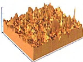
Magnified standard shower glass after exposure to typical shower conditions.

Standard glass corrodes, leaving it full of tiny pits and ridges that attract and hold scum.